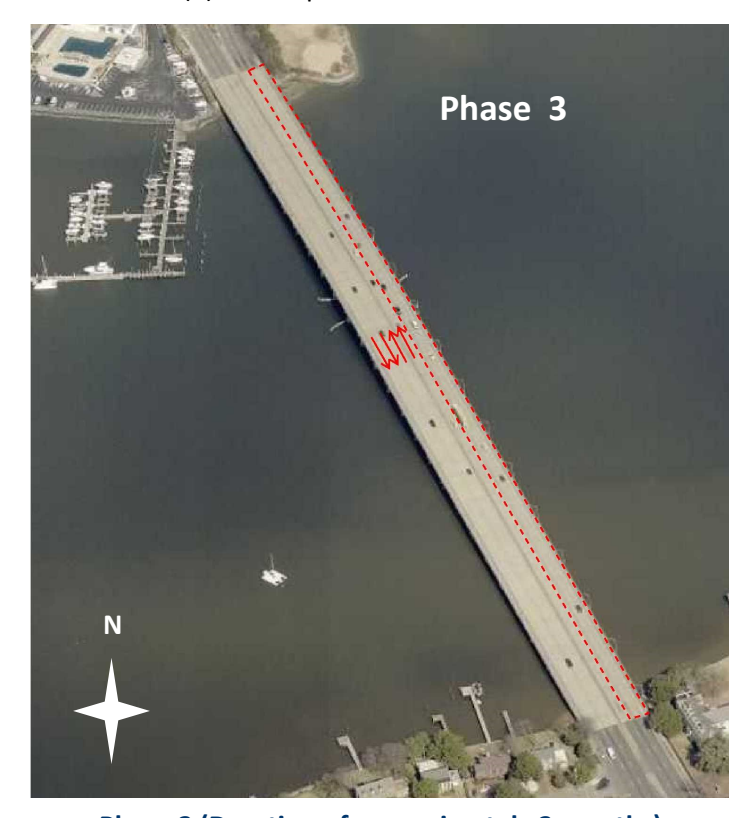
Phase 3 (Duration of approximately 3 months)