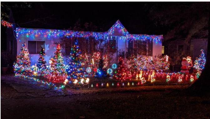
Best Whimsical Lights Display 7727 Ruthven Rd