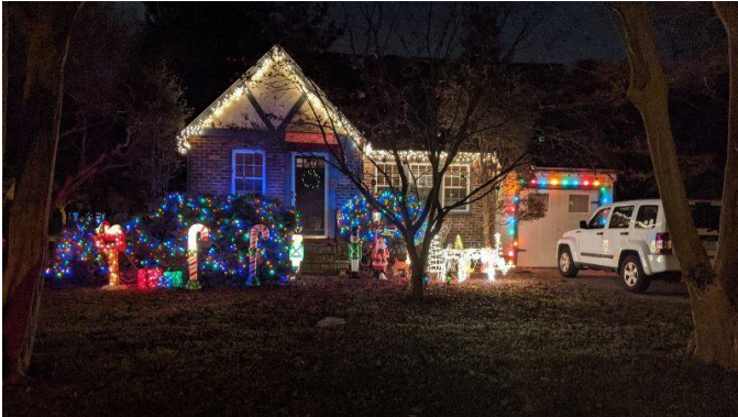
Best Traditional Lights Display 301 Burleigh Ave

The winners of this year's neighborhood holiday lights competition are below. Hopefully you were all able to see these impressive displays before they were taken down. Category and overall winners each received gift certificates to local restaurants. Thank you to all who decorated this holiday season and made our neighborhood a little bit brighter. Happy Holidays!